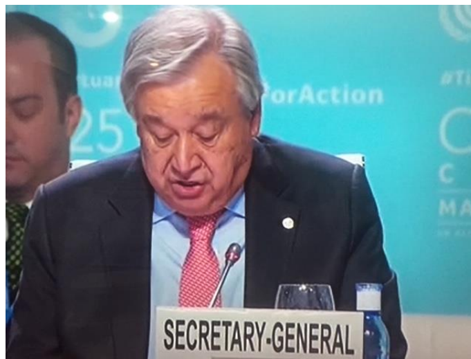
Figure 1: The Secretary General