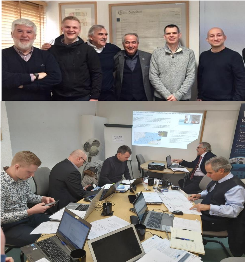
Figure 5 and 6 (above) is of the partner meetings based at Berkeley House.