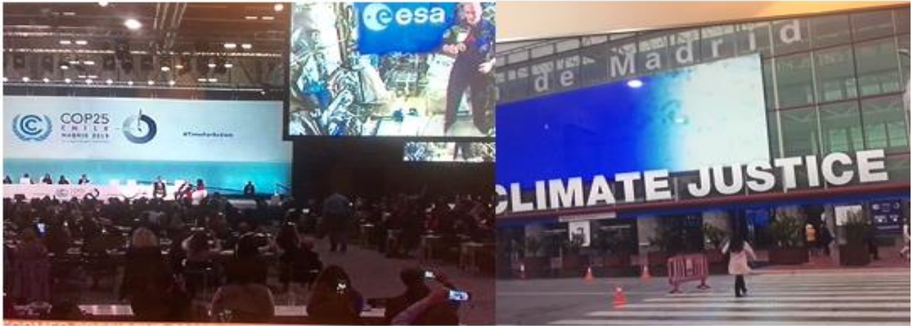
Figure 2: The Conference Setting

Next meeting of COP (COP26) was planned to take place in Scotland in 2020. Any new developments will be reported in the next up-date.