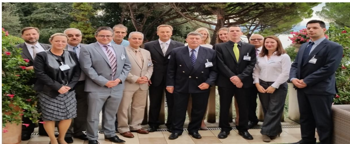
Figure 1 - Project Partners of the ACTs project

The ACTs final conference took place as part of the International Association of Maritime Universities (IAMU) General Assembly. Presenting ACTs at IAMU provided the opportunity to meet colleagues attending the IAMU Assembly and to seek their feedback on the ACTs project outcomes. Student member representatives of IAMU (IAMUS) also attended the ACTs final conference which provided a golden opportunity to find out their views on the ACTs online course design, content, assessment strategy and delivery method.