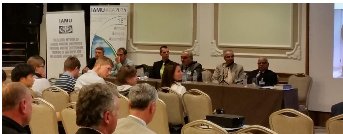
Figure 4 - Panel discussion at IAMU, ACTs final conference