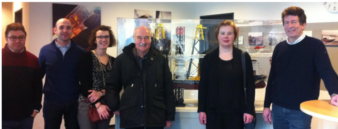
Figure 10 – MariePRO Partners in Germany