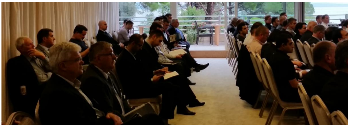
Figure 3 - Members of the IAMU participating in ACTs final conference