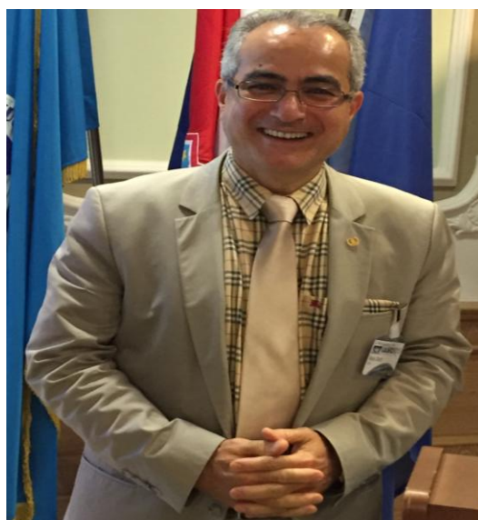
Figure 2 - Professor Ziarati presenting at the IAMU, ACTS final conference