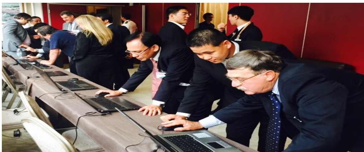
Figure 7 - Representation of Maritime Community exploring the capability of ACTs online eCOLREGs