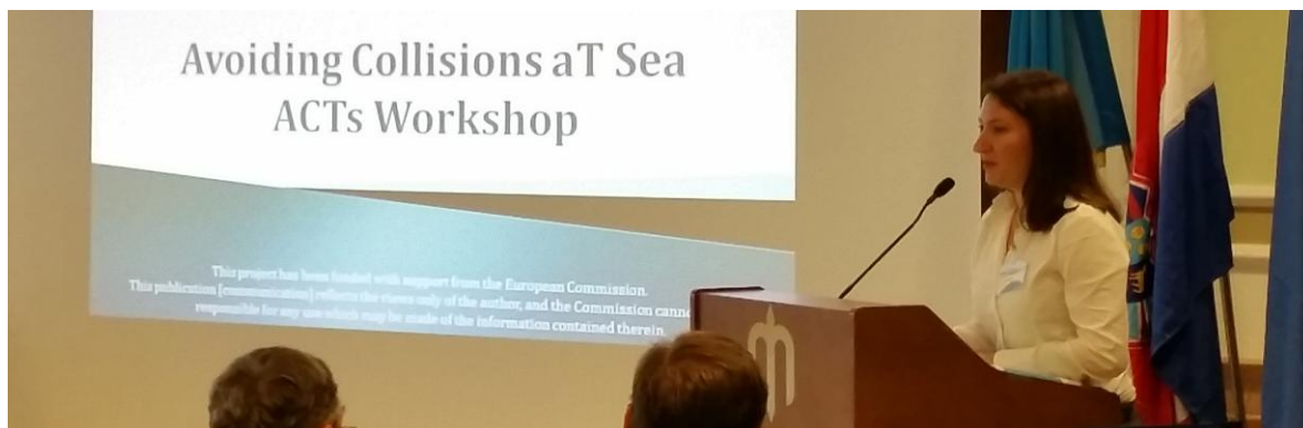
Figure 6 - Tina Matovina representative of Croatian National Agency presenting the ACTs project to participant at the ACTs final conference