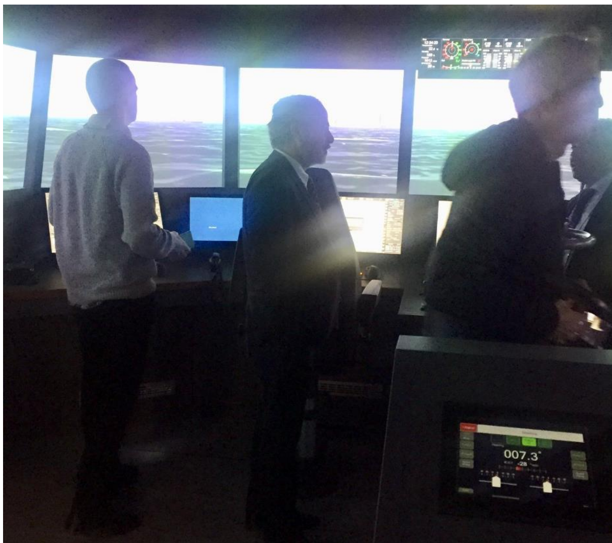
Photo 5: Partner visits the centre's Crown Jewel 360 degrees full mission ship simulator.