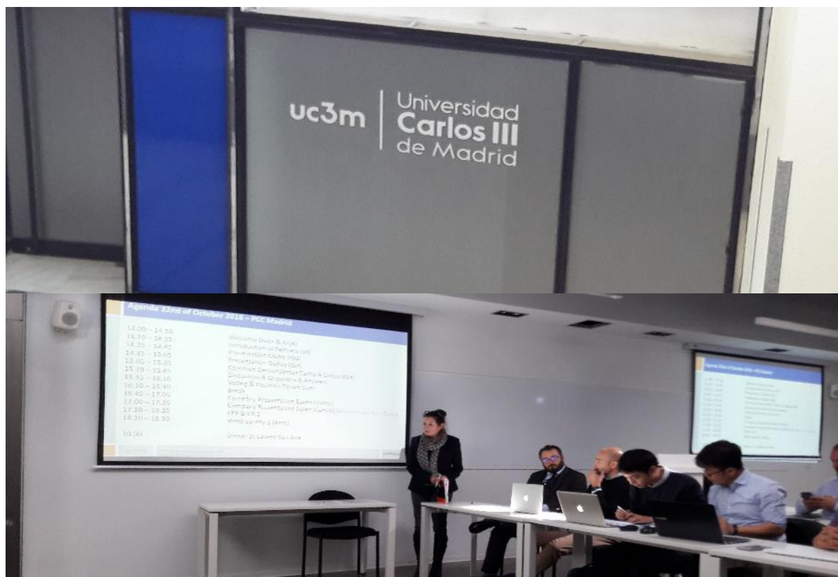
OPTIMUM Partner meeting in Madrid, October 2018

There are over 20 major industrial partners supporting this project.