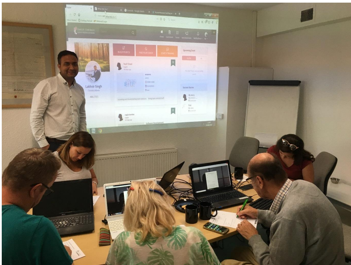
Pilot testing in Kenilworth, August 2019 MariLANG Project

Great news! The evaluation report has now been concluded and project scored 93%. This is a welcoming news for the partners and a recognition of their hard work in bringing the project to a brilliant end.