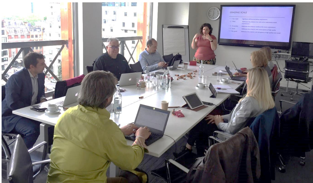
UniBus Project Partner meeting in London

The international project partner meeting took place at Liverpool University London campus, UK, on 16-17 May 2019, the partners have made good progress on IO3 and IO4 UniBus Cloud Platform.