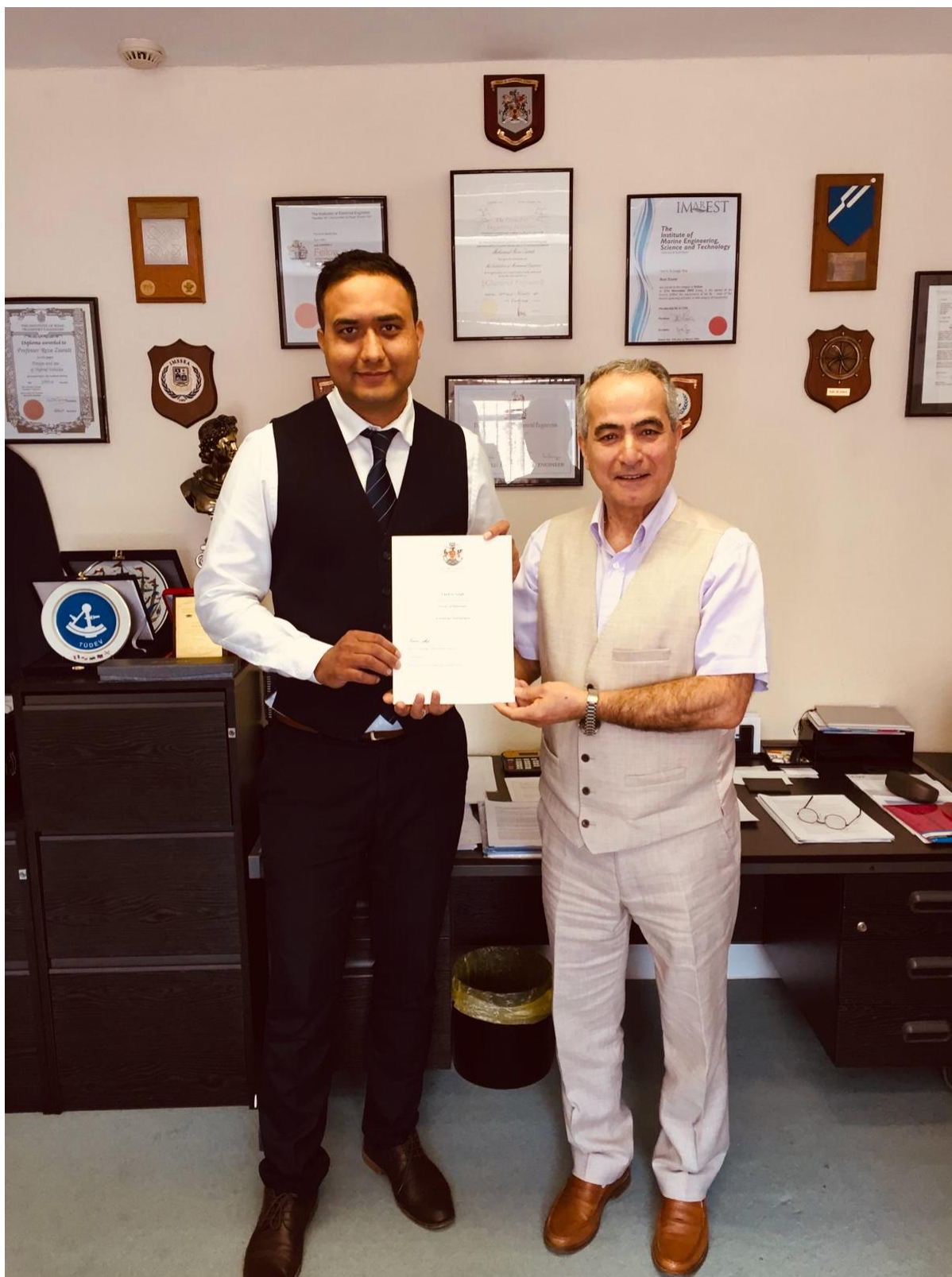
Fig 3 – PhD Photo