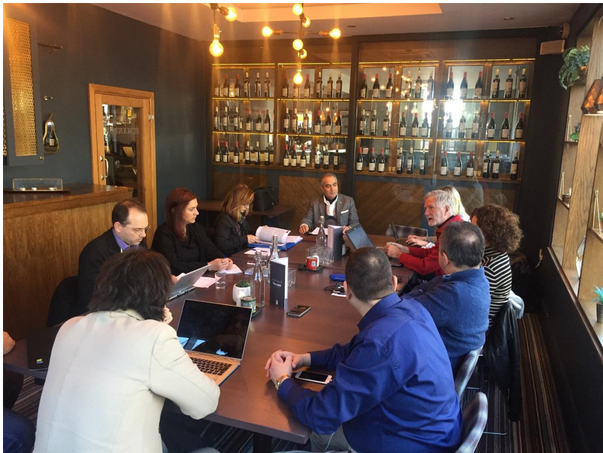
#Mentor4WBL@EU project Meeting, Kenilworth 10 th and 11 th April 2019

The project meeting of Mentor took place in Kenilworth, 10-11 th April 2019. The first workshop of the project was held on 10 th April 2019 at Warwick University. C4FF coordinated the meetings during the two-day event and take a lead in the workshop.