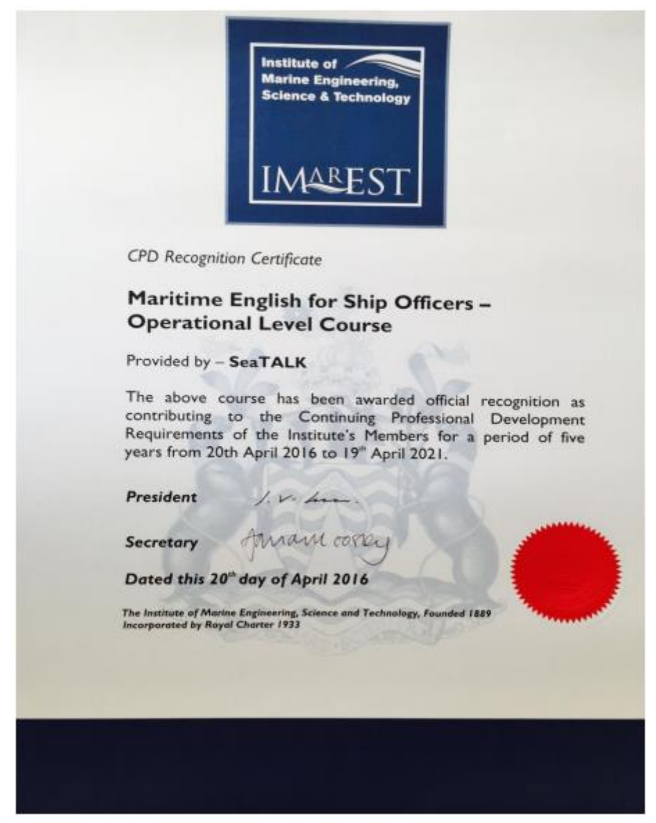
Photo 14 – The IMarEST Certificate of Continuing Professional Development (CPD) awarded to SeaTALK

The European Commission evaluation of the SeaTALK project (<u>www.seatalk.pro</u>) is highly encouraging. The project scored 9 out of 10 for final results and 9 for dissemination. evaluation. The average grade awarded was 7.24.