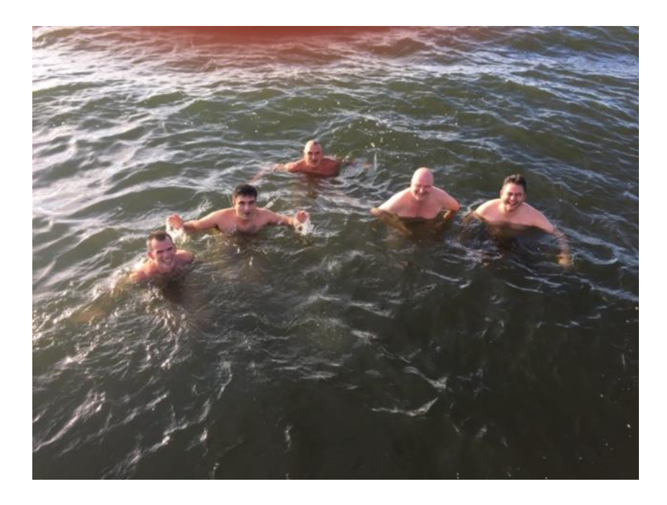
Photo 4 – The five braves bathing in freezing waters of the Baltic sea