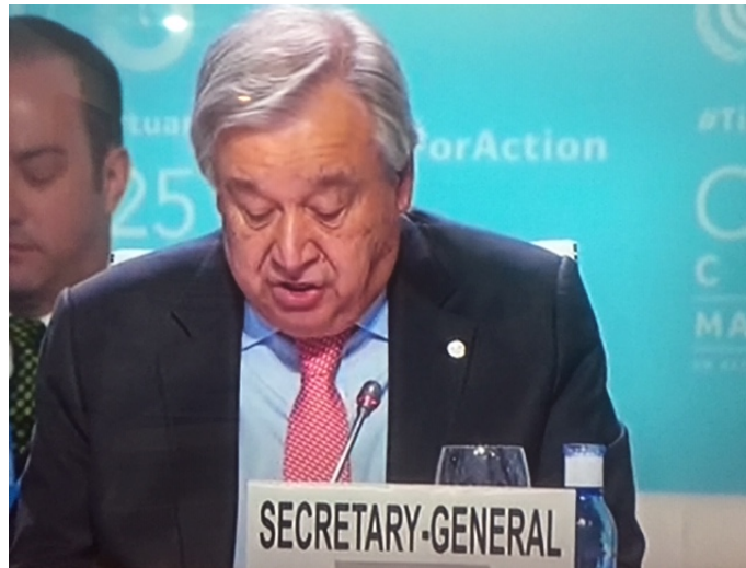
Figure 1: The Secretary General