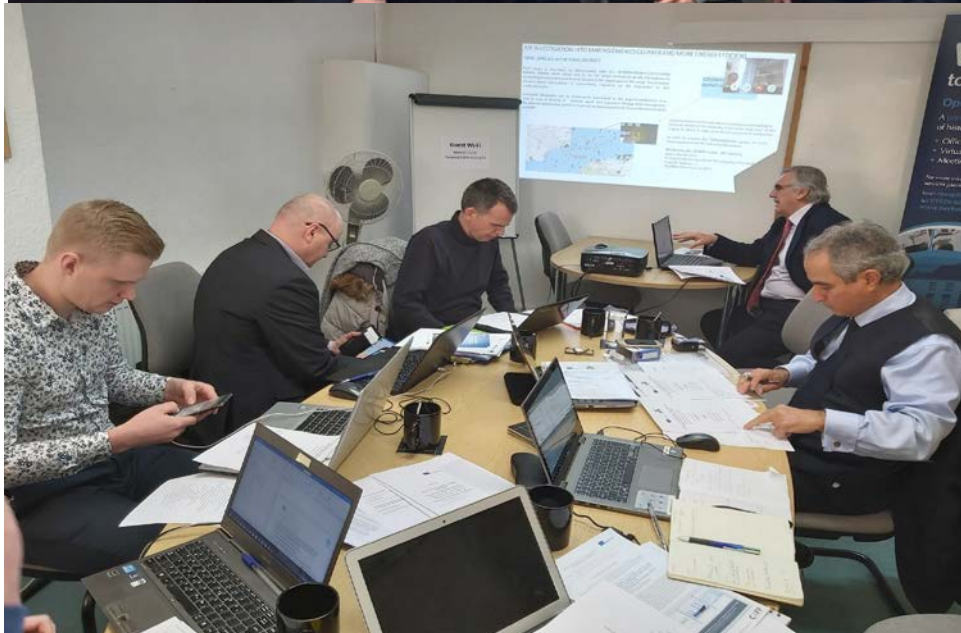
Figure 5 and 6 (above) is of the partner meetings based at Berkeley House.