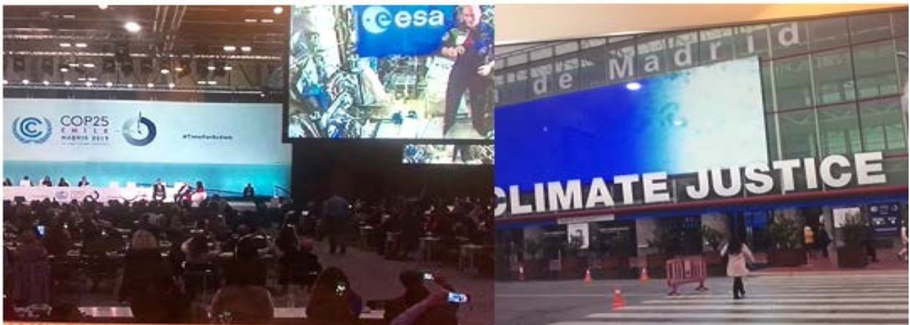
Figure 2: The Conference Setting