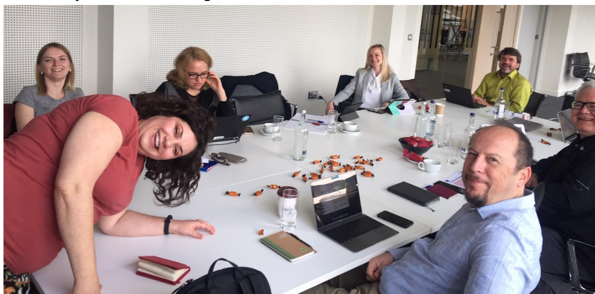
UniBus Project Partner meeting at Liverpool University London Campus

The partners have produced the initial draft of UniBus Platform and its services and now finalising the architectural design to develop the cloud platform. This cloud platform is based on S-o-Architecture and will support the services proposed in UniBus Concept. The architecture provides horizontal services (knowledge search engine, data persistence, etc) and vertical services (collaboration project management: service to support definition of project challenges by companies, to help selection of challenges by HEIs, to support the search of finance etc). These services will also be designed during this task. The behaviour and architecture of the cloud platform is modelled on the Service-Oriented Modelling Framework (SOMF), and the result of this activity will be included as part of the design documentation led by C4FF.