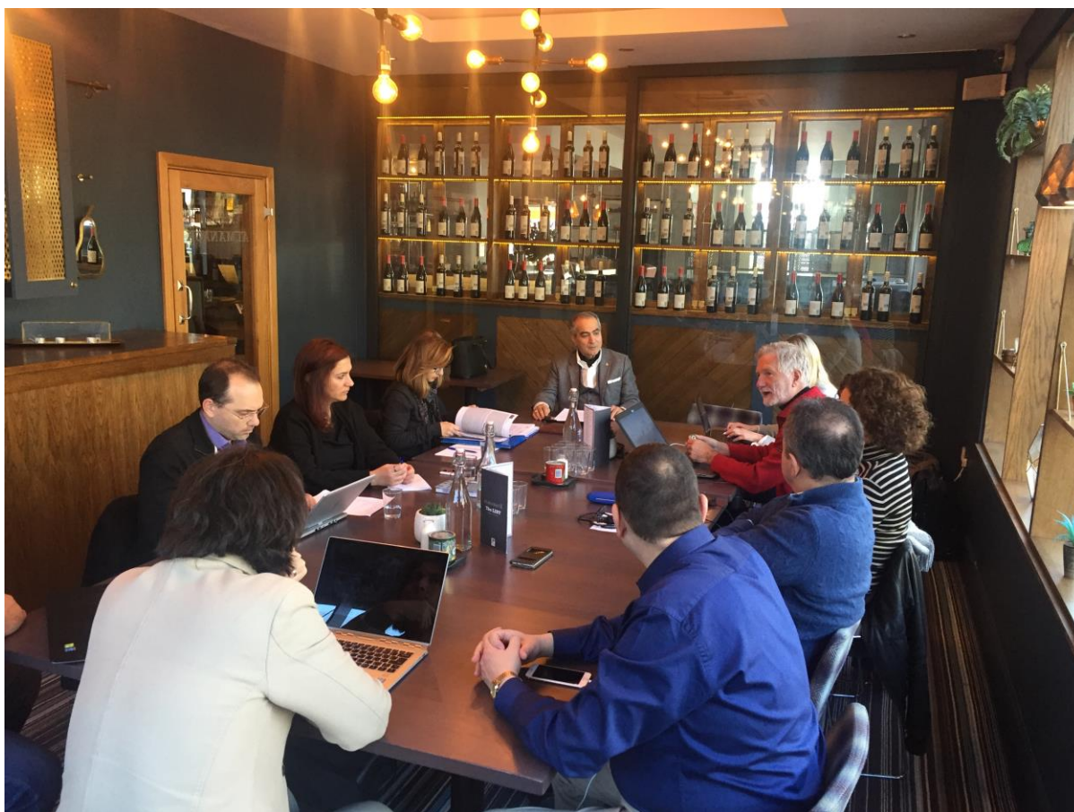
#Mentor4WBL@EU project Meeting, Kenilworth 10 th and 11 th April 2019

The project meeting of Mentor took place in Kenilworth, 10-11 th April 2019. The first workshop of the project was held on 10 th April 2019 at Warwick University. C4FF coordinated the meetings during the two-day event and take a lead in the workshop.