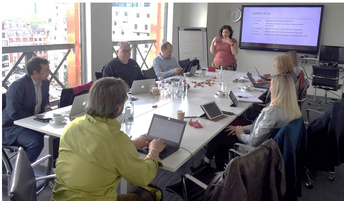
UniBus Project Partner meeting in London