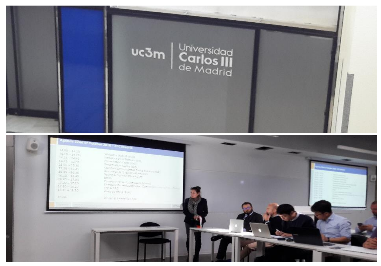
OPTIMUM Partner meeting in Madrid, October 2018