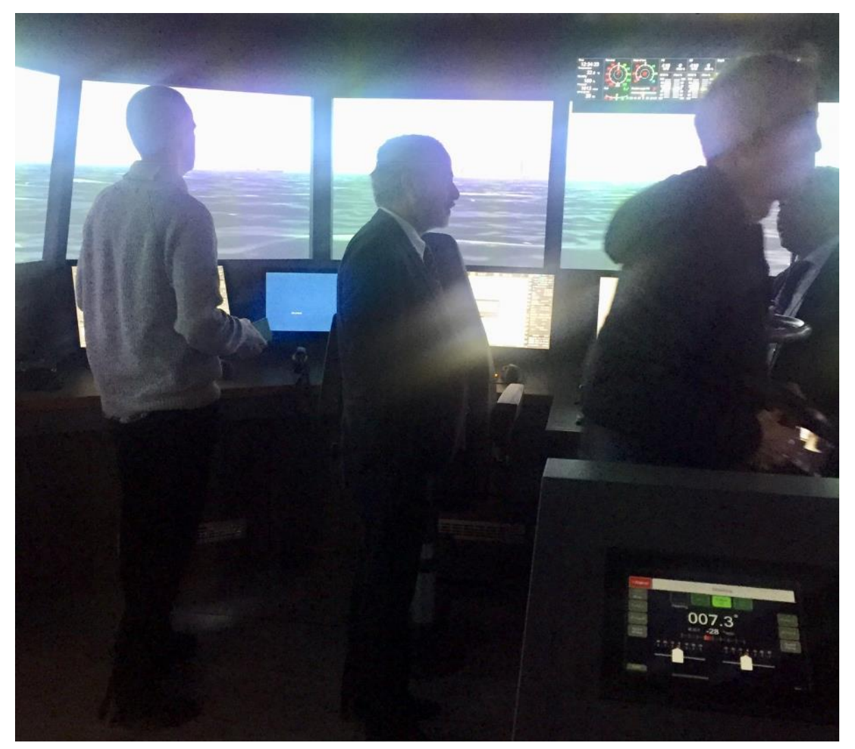
Photo 5: Partner visits the centre's Crown Jewel 360 degrees full mission ship simulator.