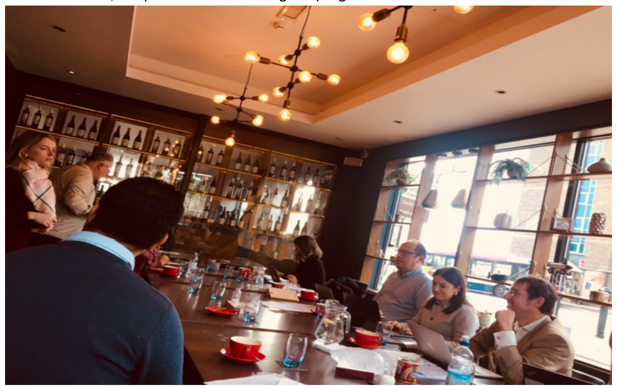
UniBus Project Partner meeting in Kenilworth

Since the last meeting of UniBus project which took place at C4FF, Kenilworth, UK, on 1-2 November 2018, the partners have made good progress on IO4 UniBus Cloud Platform.