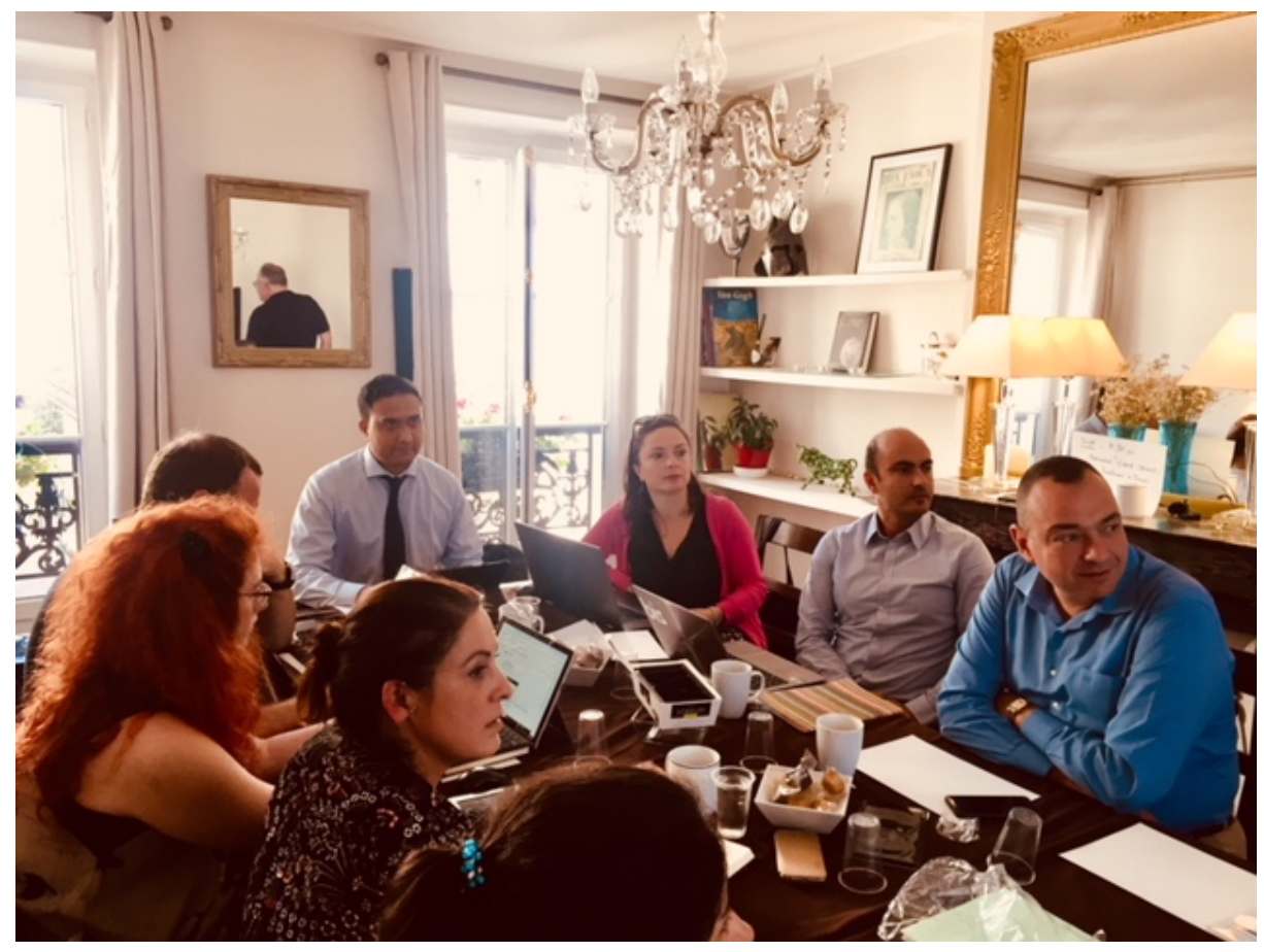
Career Comeback Support Program for Women (CCSP-W) France 18-19 October 2018.

The project is progressing well and is being implemented as outlined in the proposal. The project partners met in Paris, France on 18-19 October 2018 to discuss the progress and plan for future activities. Some of pictures from the Paris meeting are presented below.