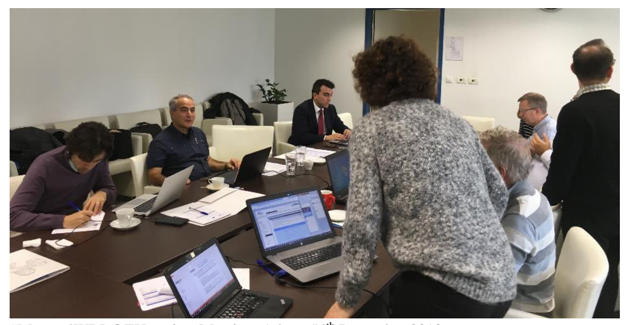
#Mentor4WBL@EU project Meeting, Athens "4th December 2018

The next meeting of Mentor will be taking in Kenilworth, 10-11<sup>th</sup> April 2019. The first workshop of the project will be help on 10<sup>th</sup> April 2019 at Warwick University. C4FF has agreed to coordinate the meetings during the two-day event and take a lead in the workshop.