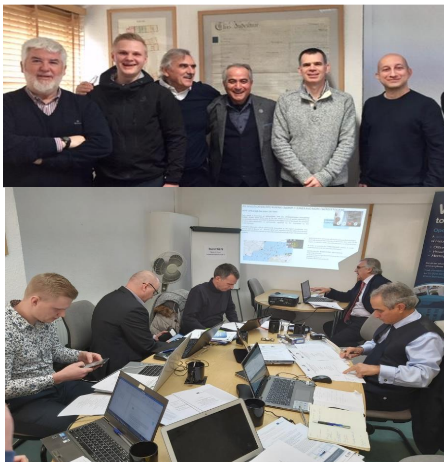
Figure 5 and 6 (above) is of the partner meetings based at C4FF, Berkeley House

The Satakunta University of Applied Sciences (SAMK) has organised an online event on Towards Zero Emissions on Thursday 29 October 2020 at 10.00–13.00. For more information click here