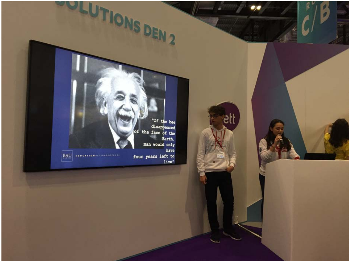
Photo 2 – The student from BAU TR schools presenting their STEM success in Turkey.