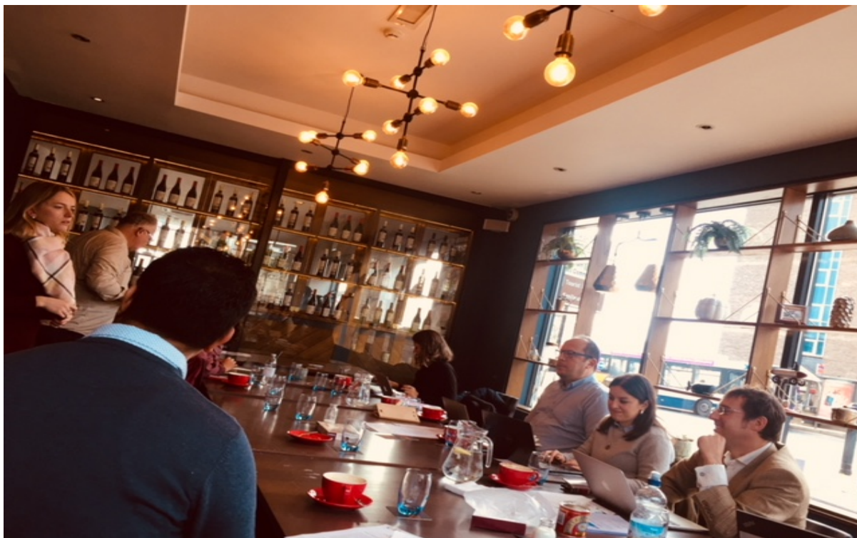
UniBus Project Partner meeting in Kenilworth