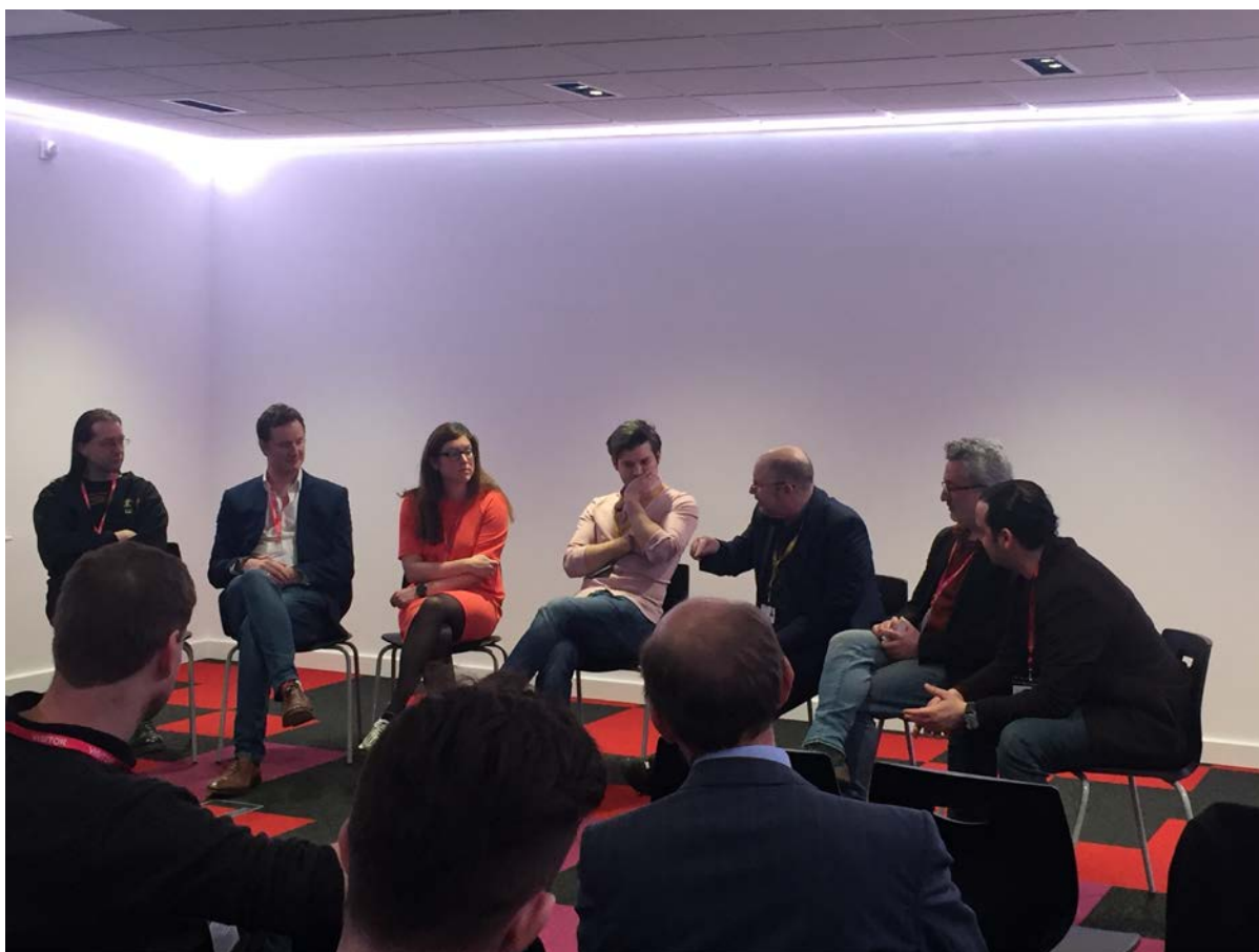
WCG Games Conference