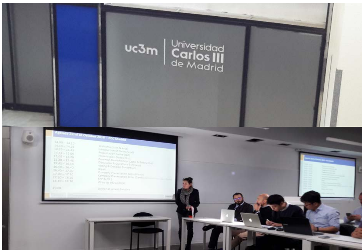
OPTIMUM Partner meeting in Madrid, October 2018