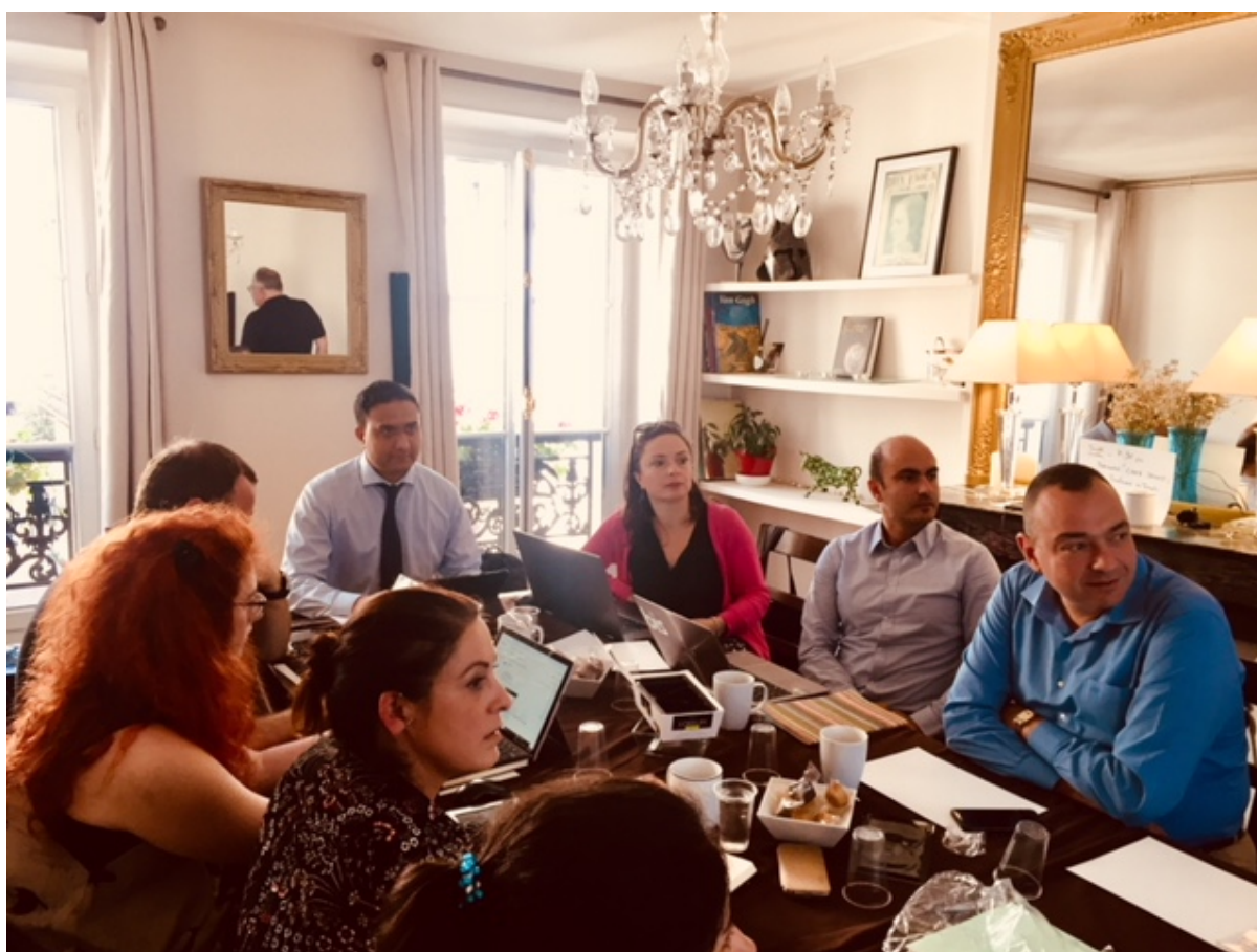
Career Comeback Support Program for Women (CCSP-W) France 18-19 October 2018.

The project is progressing well and is being implemented as outlined in the proposal. The project partners met in Paris, France on 18-19 October 2018 to discuss the progress and plan for future activities. Some of pictures from the Paris meeting are presented below.