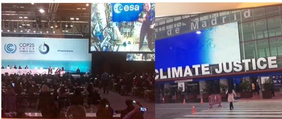
Figure 2: The Conference Setting