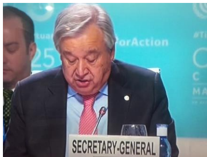
Figure 1: The Secretary General

Agreement, governments agreed to update their climate plans by 2020. COP 25 will bring together heads of state, climate officials, non-governmental organizations, youth groups and local movements and other non-state actors to respond to the climate emergency. The next step is for the countries to update their climate plans and boost their ambition by 2020 in line with the Paris Agreement. COP 25 is a moment to ensure they are aware of the 2020 calendar and start doing their homework. Below is figure 2 which shows some photos of the inside and outside of the conference and figure 1 is the Secretary-General expressing his views on the matter.