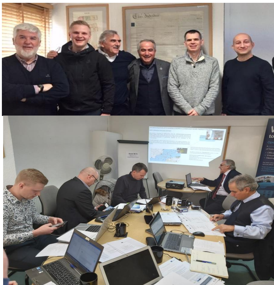
Figure 5 and 6 (above) is of the partner meetings based at C4FF, Berkeley House

The Satakunta University of Applied Sciences (SAMK) has organised an online event on Towards Zero Emissions on Thursday 29 October 2020 at 10.00–13.00. For more information click here