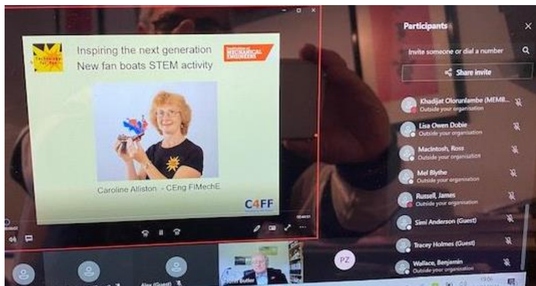
IMechE and C4FF joint New Fan Boat STEM Activity