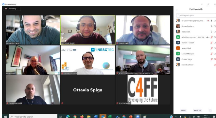
Life Skills VR Project Soft Launch on 14 th of May 2021

There have been several developments since last News in April/May 2021. The new university building has been delayed due to Covid but it is expected that new laboratories will be commissioned at the new building once completed. The air quality centre, STEM Centre and Cyber Centre are expected to be housed in the new university building. C4FF has an unrivalled track record of success with all its past and present funded projects, many awarded as 'Best in Europe' and all with high score for the proposals and/or for project delivery.