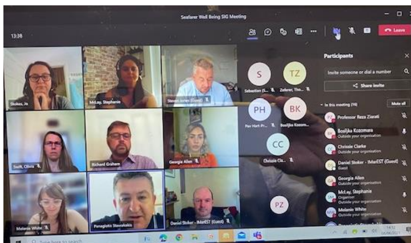
Bi-weekly meeting of Maritime SIG 8 June 2021

The last meeting of partners was held on 21 May 2021 and the next is scheduled for 18 th June 2021.