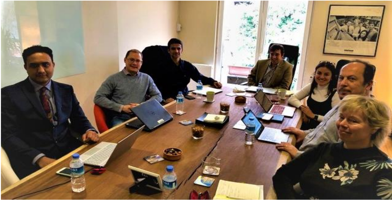
The Project Team from UK, two organisations from Finalnd, Turkey and Portugal