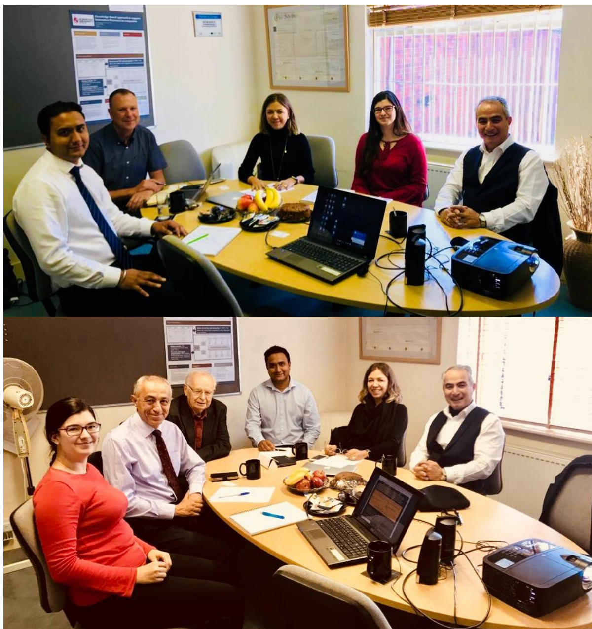
Figure 2. First academic board and first advisory board meeting took place at University offices, Kenilworth on 27 and 28th September respectively.