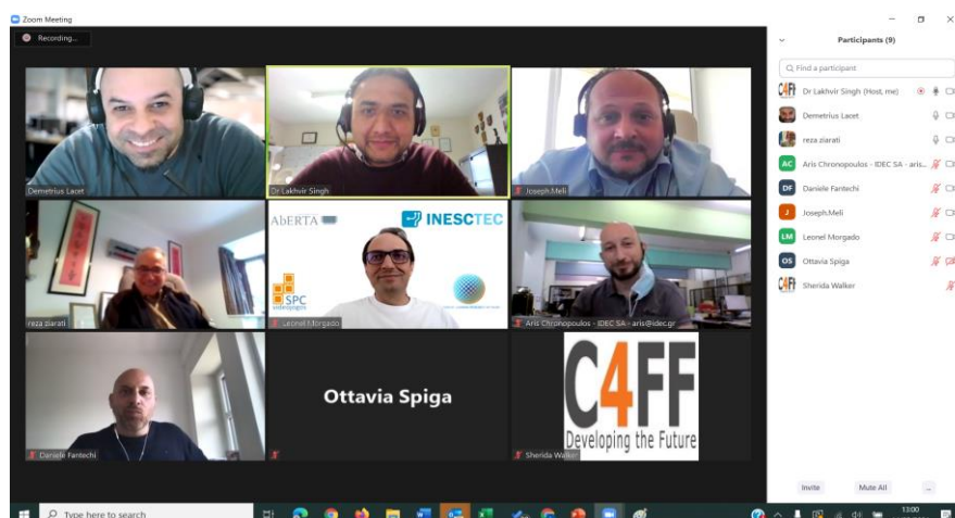
Life Skills VR Project Soft Launch on 14 th of May 2021

There have been several developments since last News in April/May 2021. The new university building has been delayed due to Covid but it is expected that new laboratories will be commissioned at the new building once completed. The air quality centre, STEM Centre and Cyber Centre are expected to be housed in the new university building. C4FF has an unrivalled track record of success with all its past and present funded projects, many awarded as 'Best in Europe' and all with high score for the proposals and/or for project delivery.