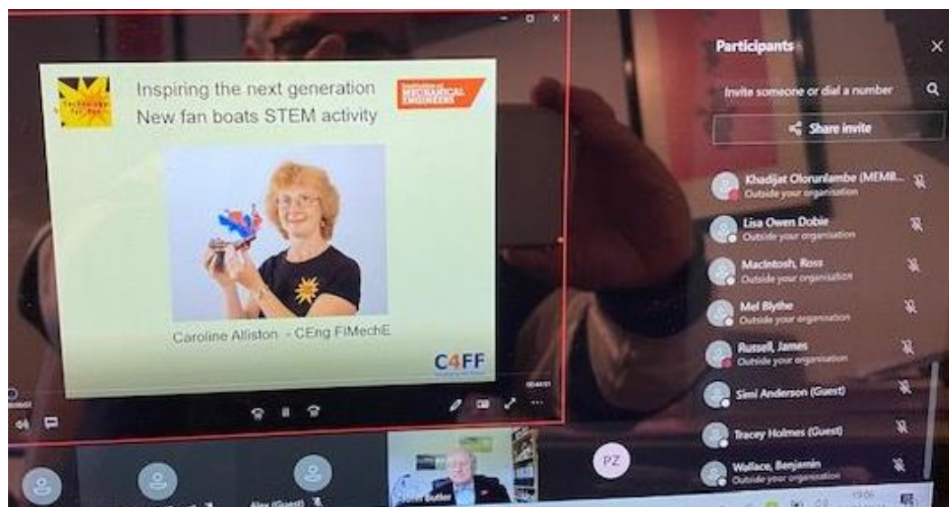
IMechE and C4FF joint New Fan Boat STEM Activity