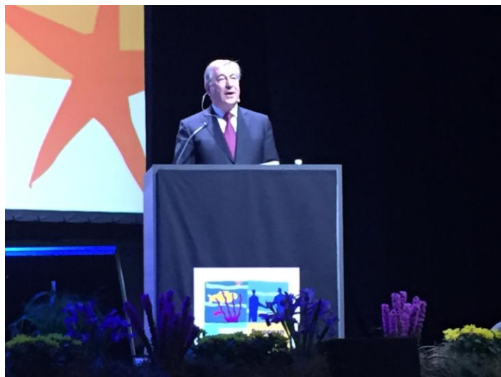
Photo 11: The EC Commissioner, Komenu Vella, giving his keynote speech at the EMD