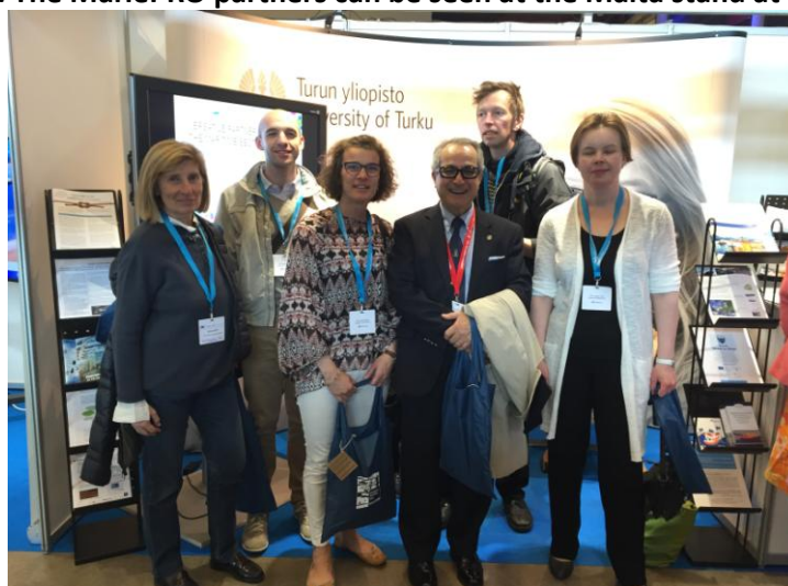
Photo 3: The MariePRO partners can be seen at the Turku University stand at the EMD.