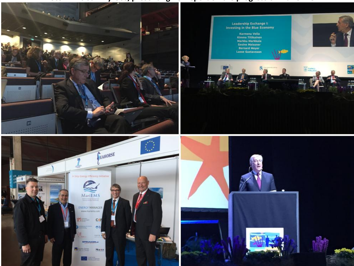
Photos 5-8: Photo of the Maritime Affairs Commissioner, Komenu Vella with sample photos from key events of MariePRO and EMD meetings.