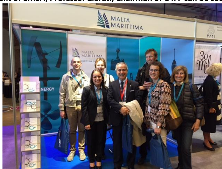
Photo 2: The MariePRO partners can be seen at the Malta stand at the EMD.