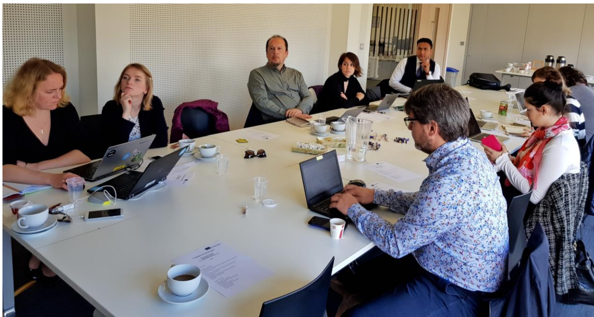
Figure 2. UniBus Project Partner meeting in London