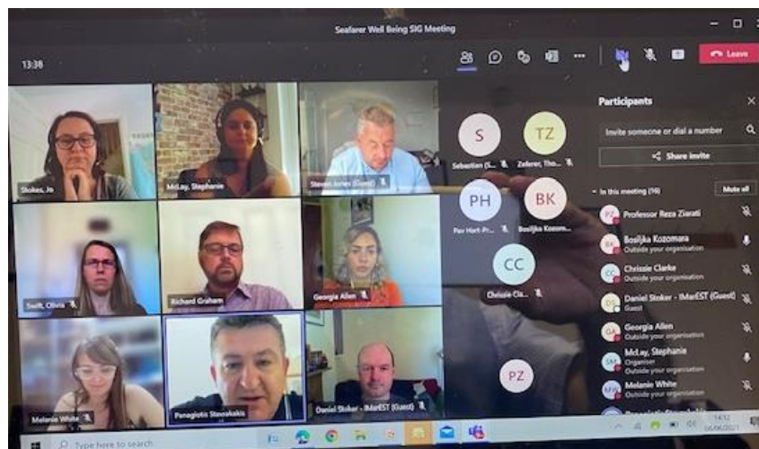
Bi-weekly meeting of Maritime SIG 8 June 2021

The last meeting of partners was held on 21 May 2021 and the next is scheduled for 18 th June 2021.