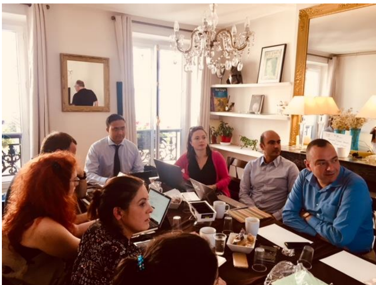
Career Comeback Support Program for Women (CCSP-W) France 18-19 October 2018.

The project is progressing well and is being implemented as outlined in the proposal. The project partners met in Paris, France on 18-19 October 2018 to discuss the progress and plan for future activities. Some of pictures from the Paris meeting are presented below.