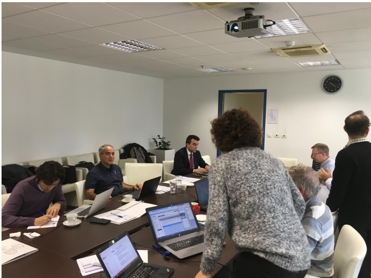
#Mentor4WBL@EU project Meeting, Athens "4 th December 2018