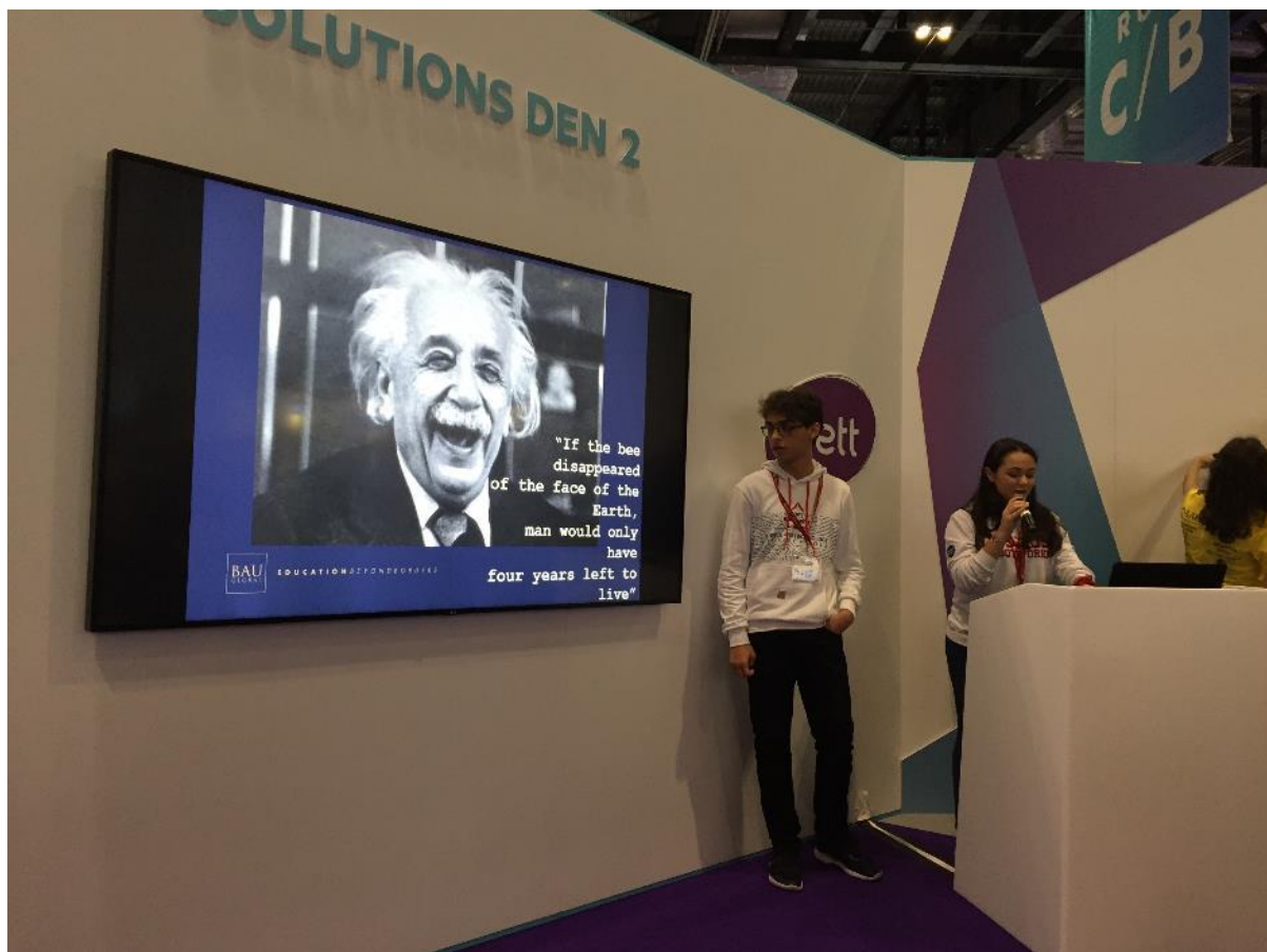
Photo 2 – The student from BAU TR schools presenting their STEM success in Turkey.