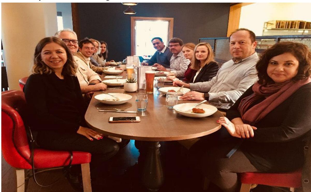
UniBus Project Partner meeting at C4FF, Kenilworth

The partners have produced the initial draft of UniBus Platform and its services and now finalising the architectural design to develop the cloud platform. This cloud platform is based on S-o-Architecture and will support the services proposed in UniBus Concept. The architecture provides horizontal services (knowledge search engine, data persistence, etc) and vertical services (collaboration project management: service to support definition of