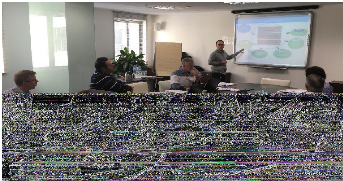
#Mentor4WBL@EU project Meeting, Athens "3 rd December 2018

The next meeting of Mentor will be taking in Kenilworth, 10-11 th April 2019. The first workshop of the project will be held on 10 th April 2019 at Warwick University. C4FF has agreed to coordinate the meetings during the two-day event and take a lead in the workshop.