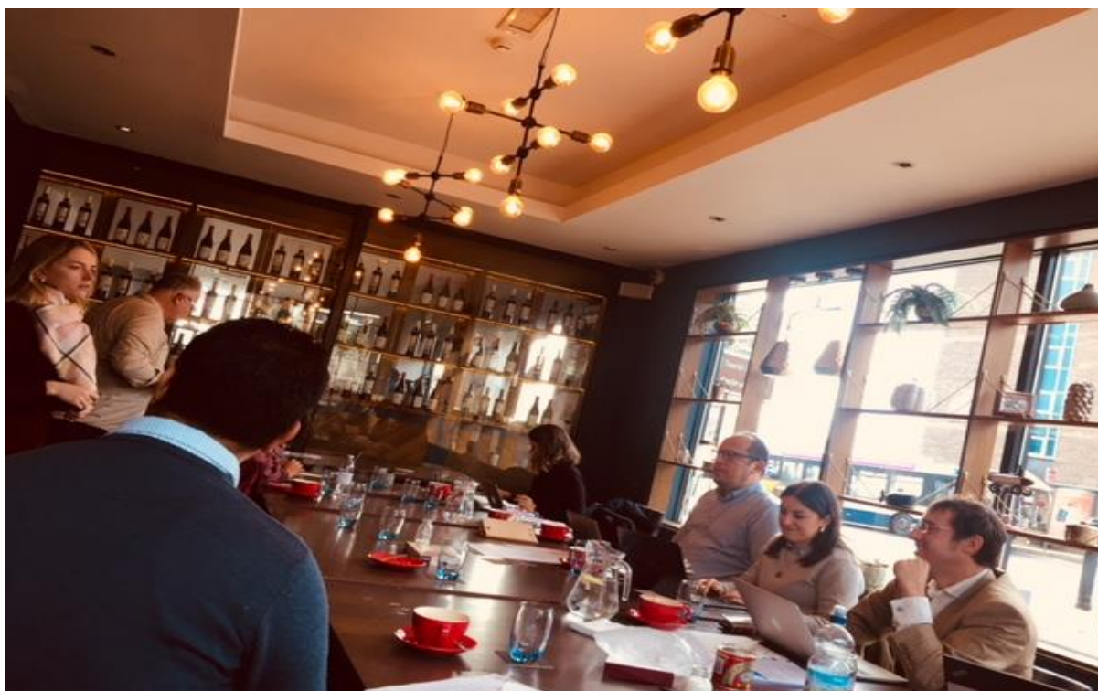
UniBus Project Partner meeting in Kenilworth