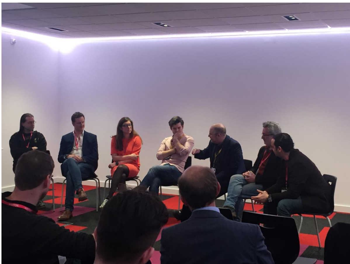
WCG Games Conference