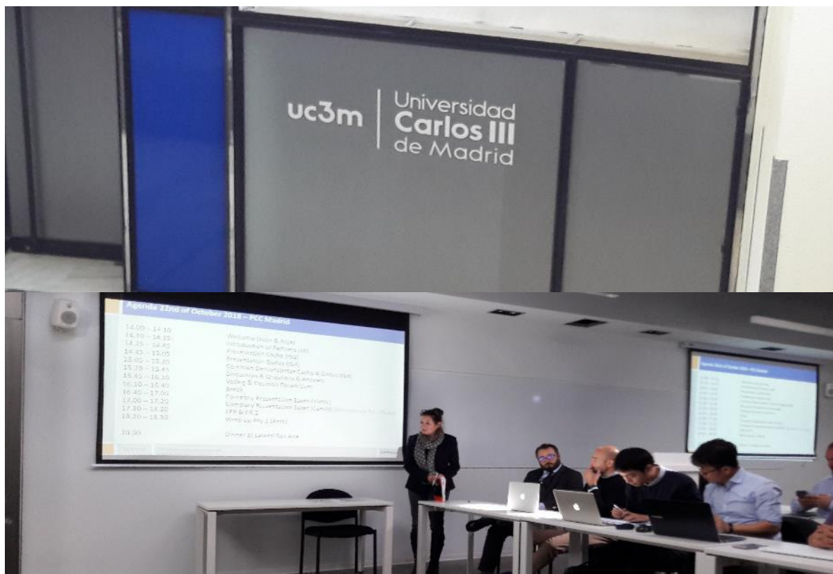
OPTIMUM Partner meeting in Madrid, October 2018