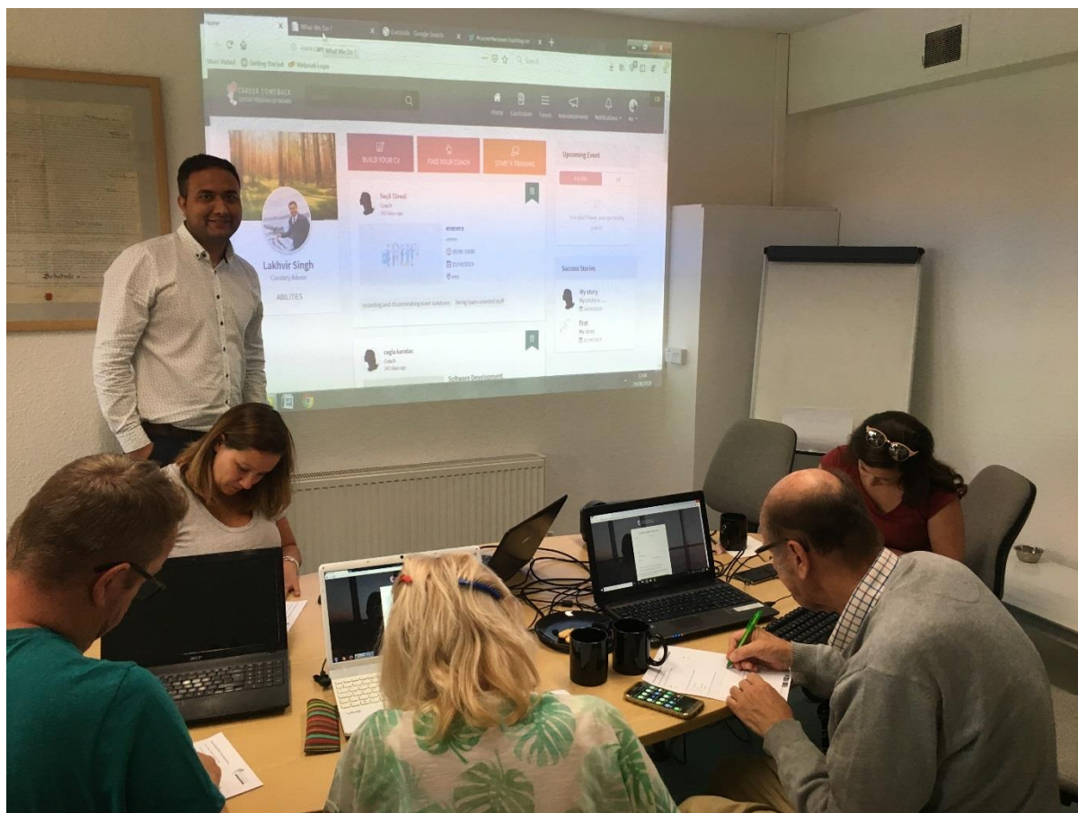
Pilot testing in Kenilworth, August 2019