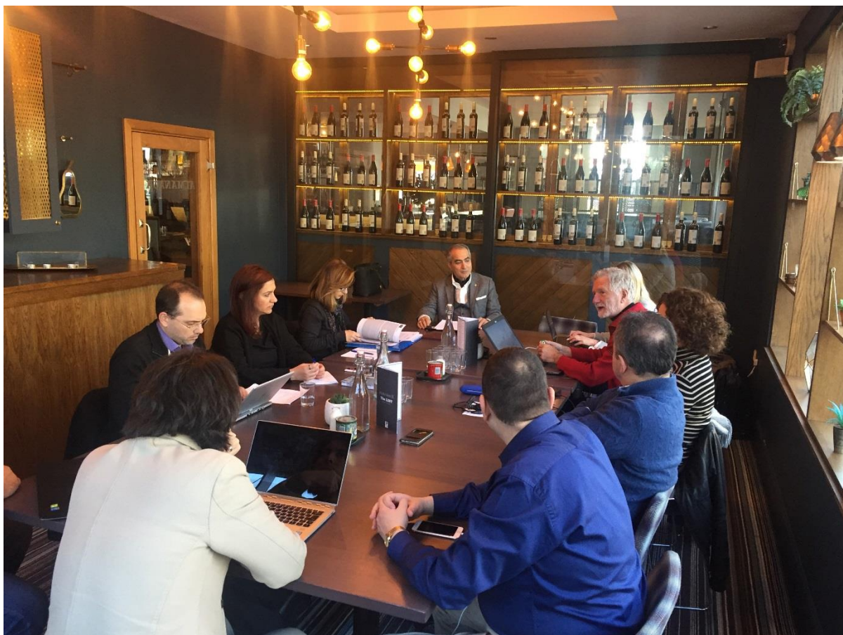
#Mentor4WBL@EU project Meeting, Kenilworth 10 th and 11 th April 2019

The project meeting of Mentor took place in Kenilworth, 10-11 th April 2019. The first workshop of the project was held on 10 th April 2019 at Warwick University. C4FF coordinated the meetings during the two-day event and take a lead in the workshop.