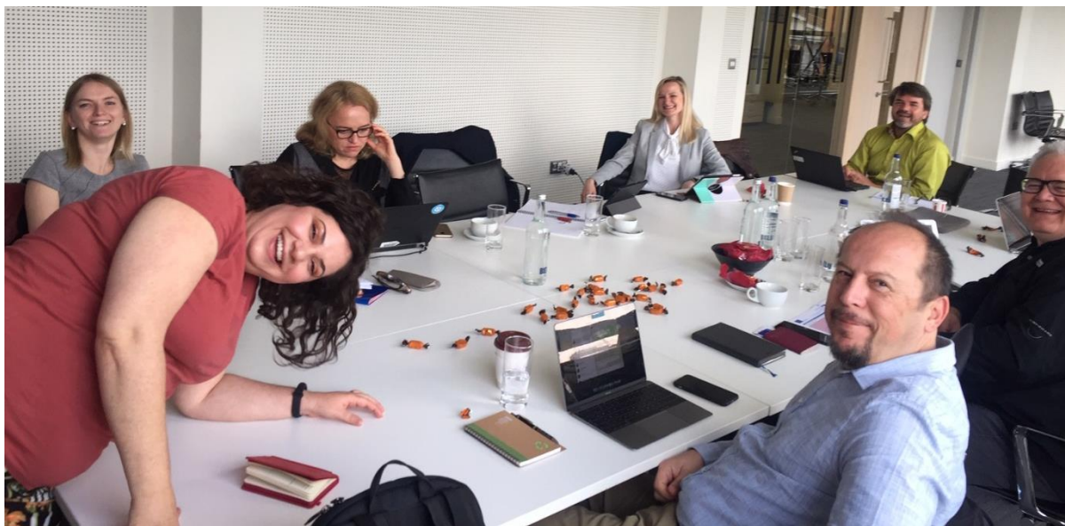
UniBus Project Partner meeting at Liverpool University London Campus

The partners have produced the initial draft of UniBus Platform and its services and now finalising the architectural design to develop the cloud platform. This cloud platform is based on S-o-Architecture and will support the services proposed in UniBus Concept. The architecture provides horizontal services (knowledge search engine, data persistence, etc) and vertical services (collaboration project management: service to support definition of project challenges by companies, to help selection of challenges by HEIs, to support the search of finance etc). These services will also be designed during this task. The behaviour and architecture of the cloud platform is modelled on the Service-Oriented Modelling Framework (SOMF), and the result of this activity will be included as part of the design documentation led by C4FF.