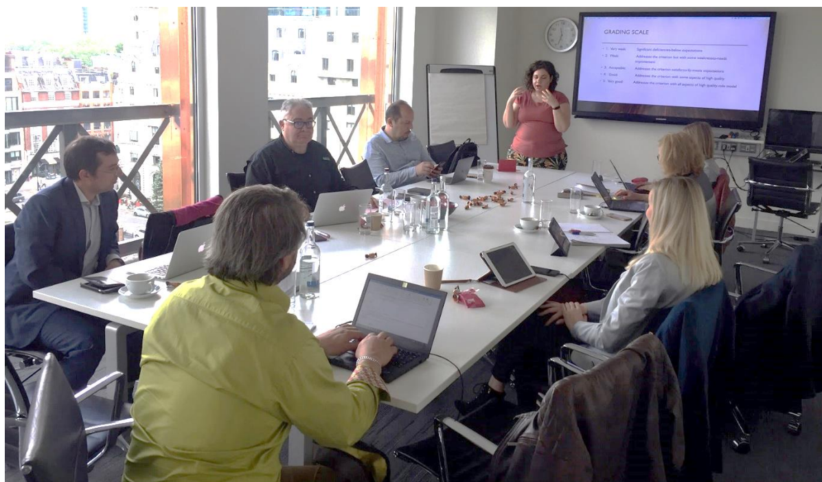
UniBus Project Partner meeting in London

The international project partner meeting took place at Liverpool University London campus, UK, on 16-17 May 2019, the partners have made good progress on IO3 and IO4 UniBus Cloud Platform.