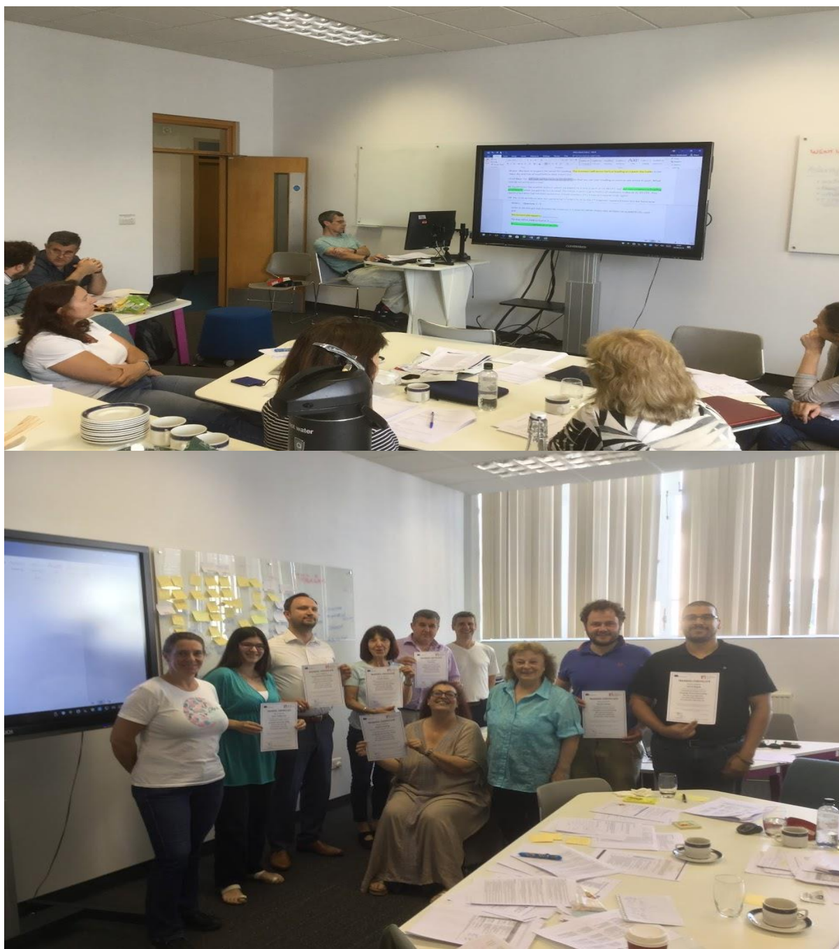
The final partner meeting and conference took place in Elsfleth, Germany on 7-9 July, hosted by Jade Hochschule the coordinator of the Mari LANG project.