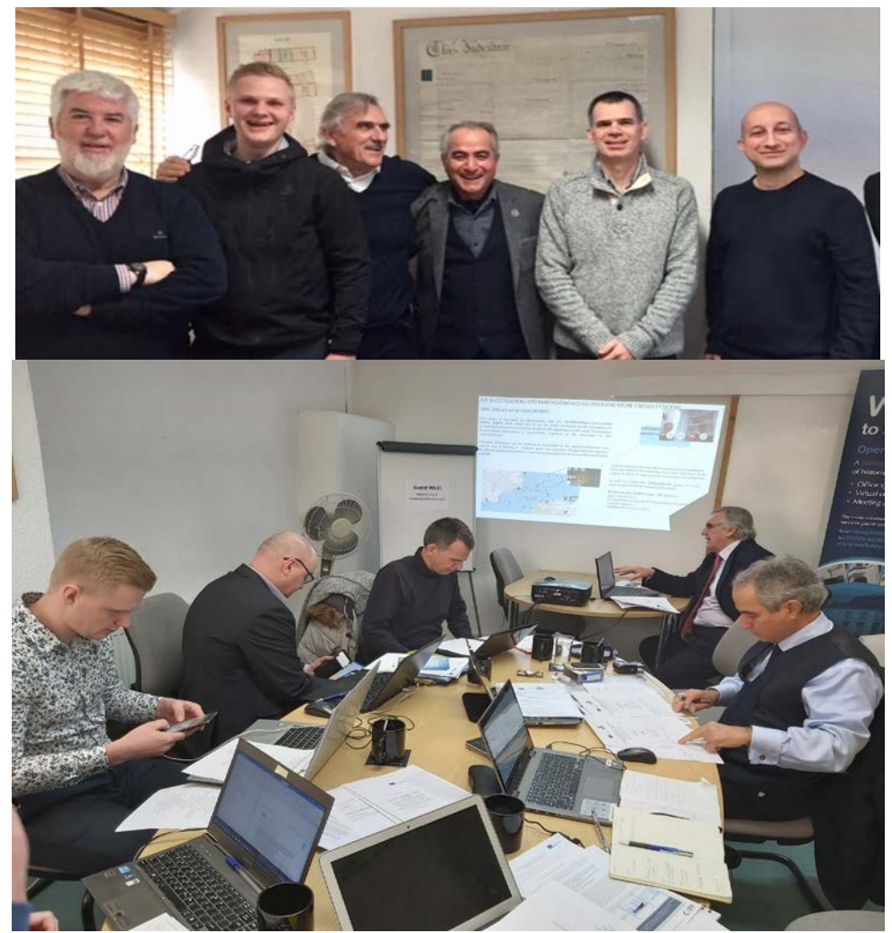
Figure 5 and 6 (above) is of the partner meetings based at Berkeley House.