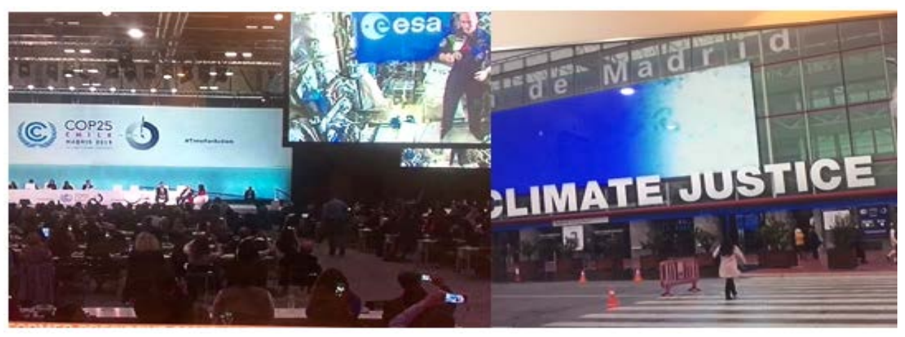
Figure 2: The Conference Setting

Next meeting of COP (COP26) was planned to take place in Scotland in 2020. Any new developments will be reported in the next up-date.