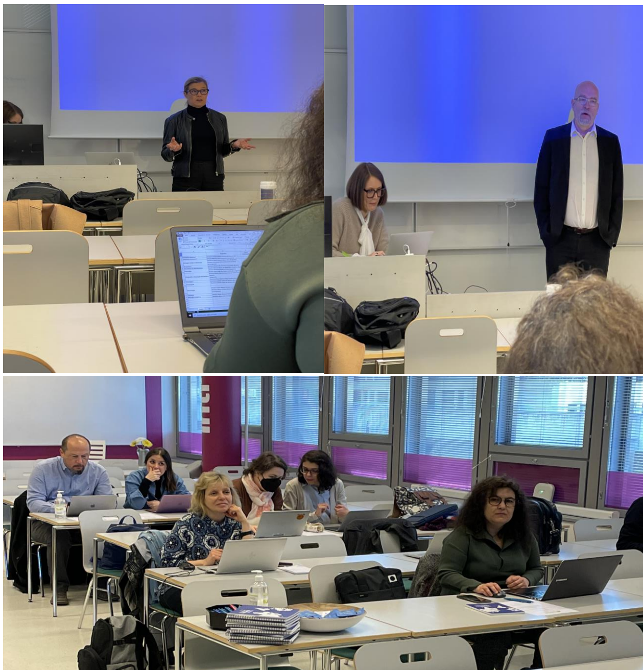
PoliUniBus Workshop in Finland.

The next partner meeting took place in Helsinki, Finland on 28-29 th April 2022 and the final conference and partner meeting is being scheduled for mid-June 2022.