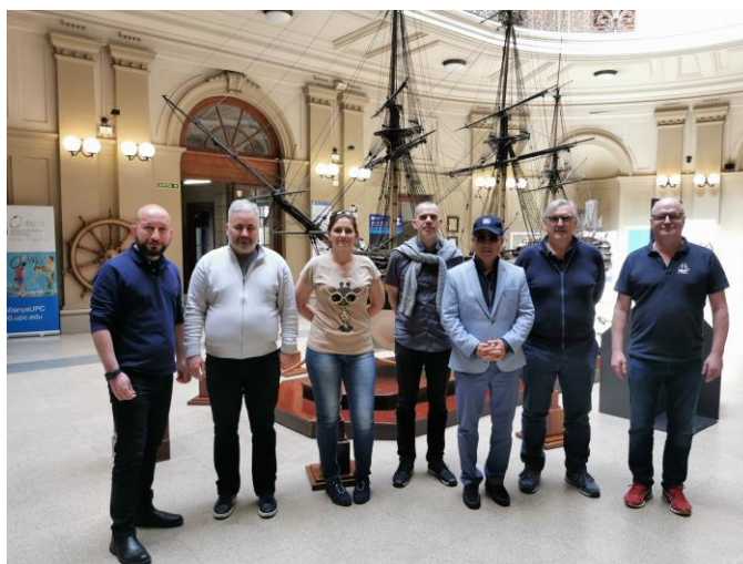
PROMETHEAS Project partners meeting in Barcelona, April 2022