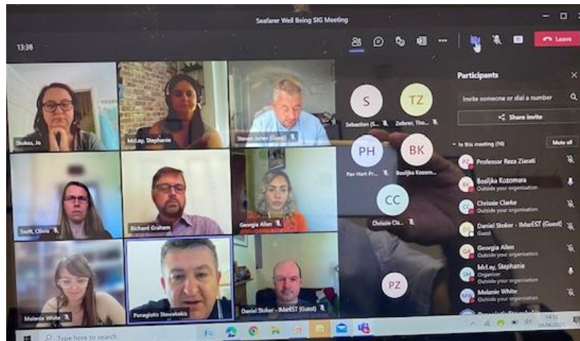
Bi-weekly meeting of Maritime SIG 8 June 2021

The last meeting of partners was held on 21 May 2021 and the next is scheduled for 18 th June 2021.