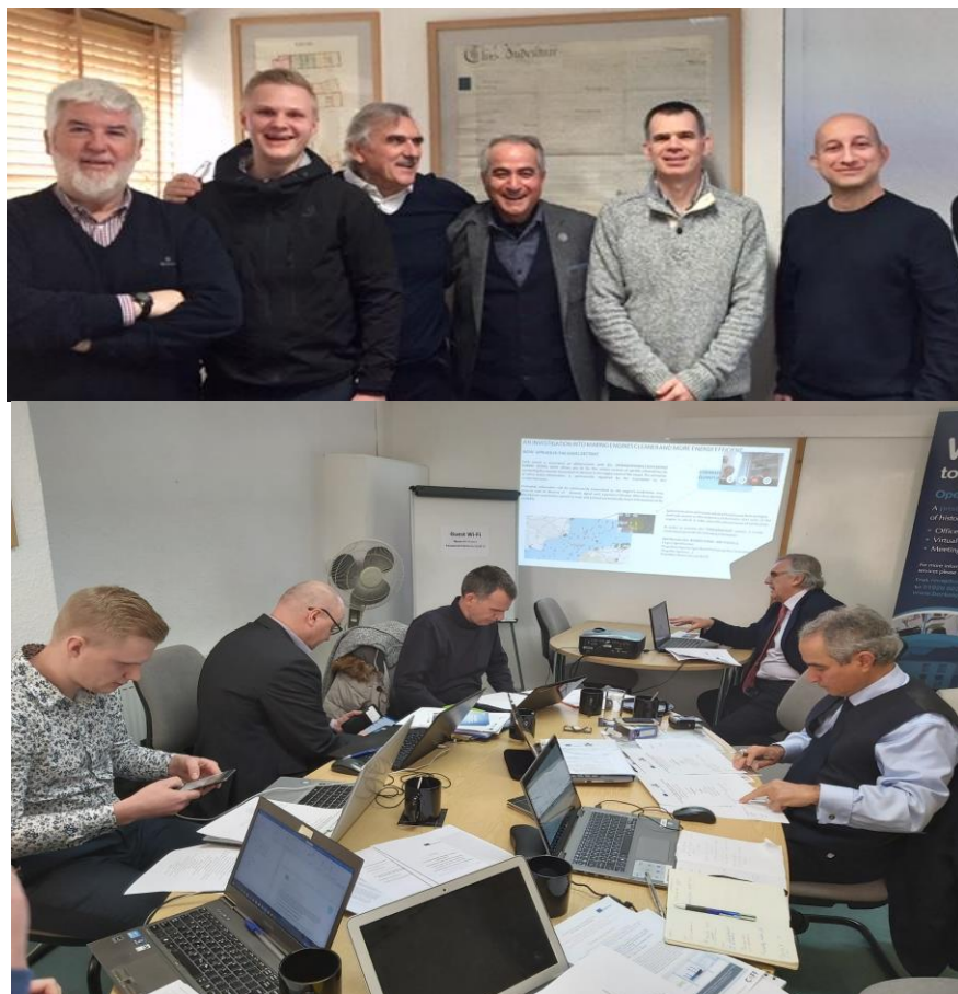
Figure 5 and 6 (above) is of the partner meetings based at C4FF, Berkeley House

The Satakunta University of Applied Sciences (SAMK) has organised an online event on Towards Zero Emissions on Thursday 29 October 2020 at 10.00–13.00. For more information click here