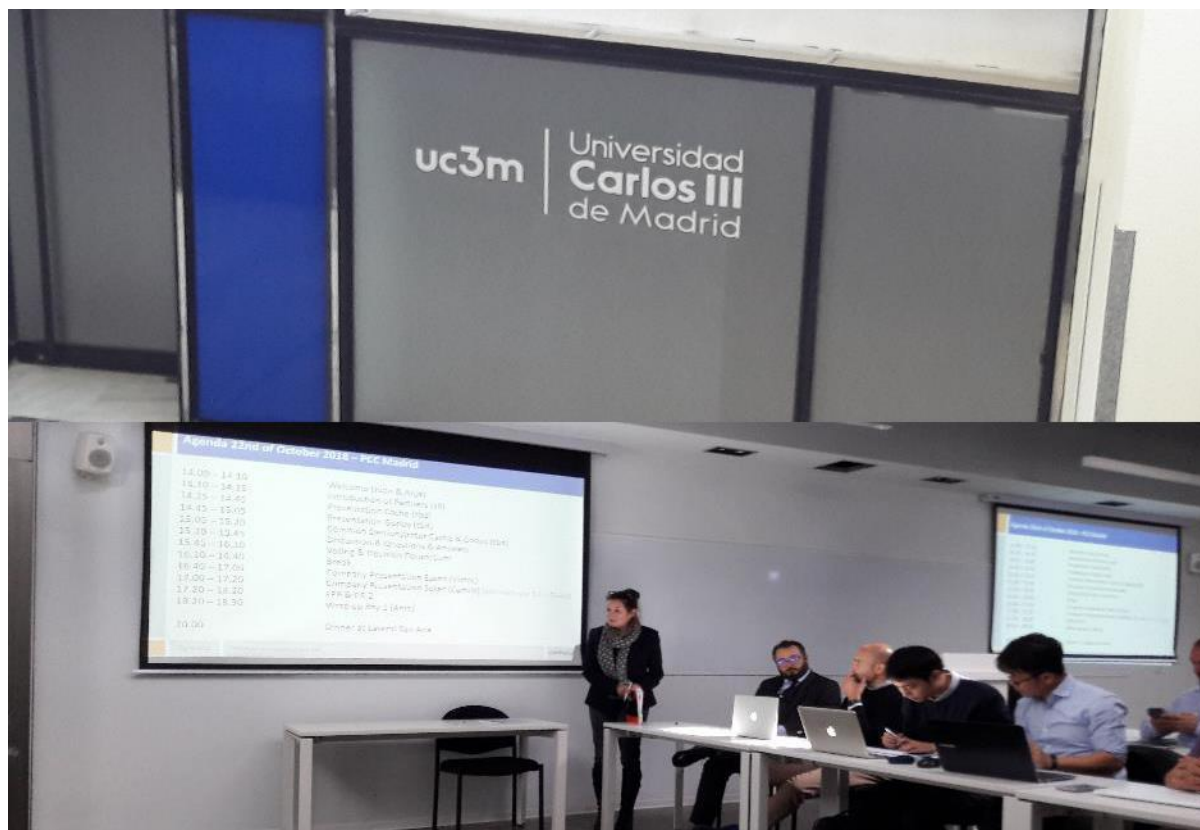
OPTIMUM Partner meeting in Madrid, October 2018