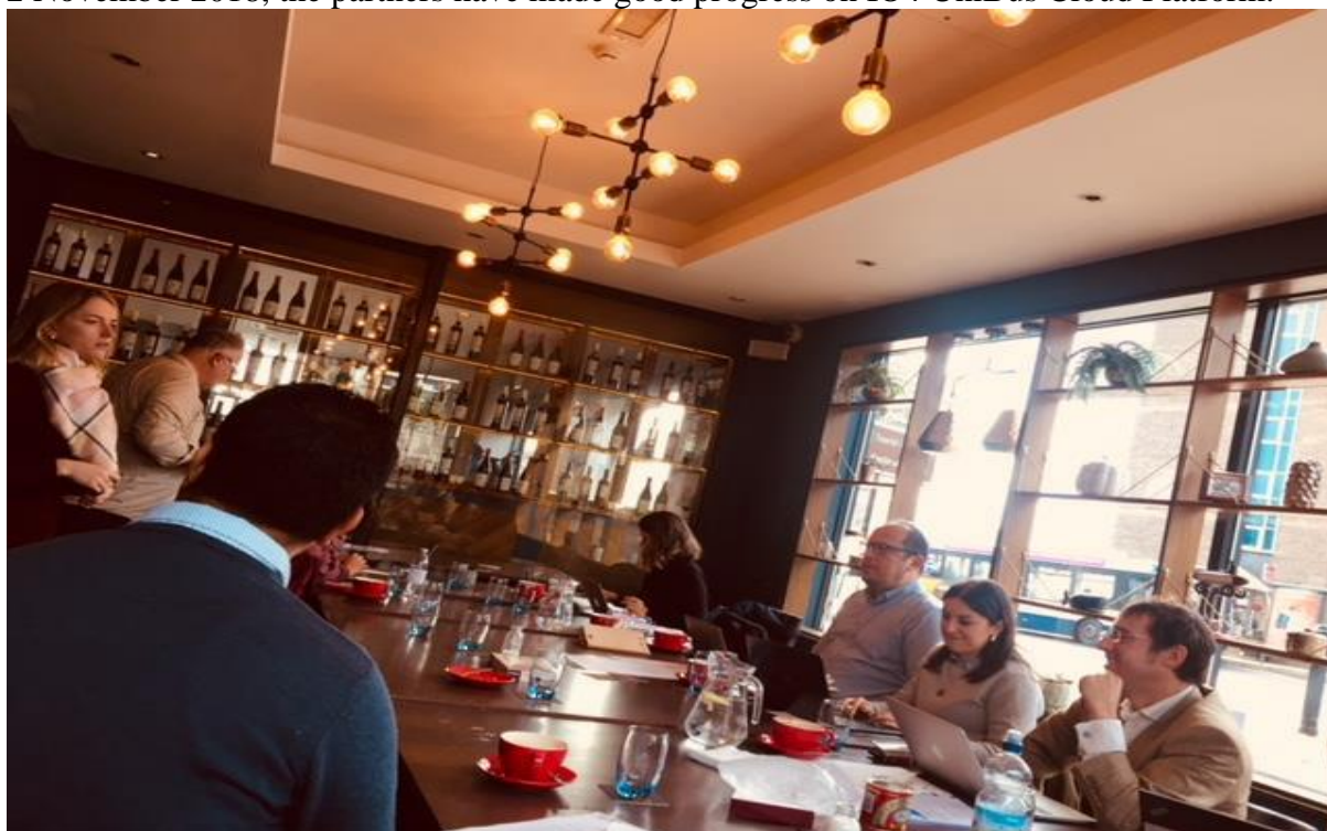
UniBus Project Partner meeting in Kenilworth

Since the last meeting of UniBus project which took place at C4FF, Kenilworth, UK, on 1-2 November 2018, the partners have made good progress on IO4 UniBus Cloud Platform.