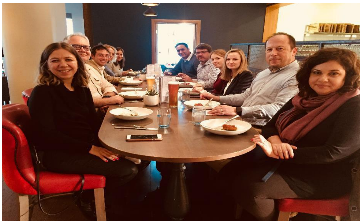
UniBus Project Partner meeting at C4FF, Kenilworth