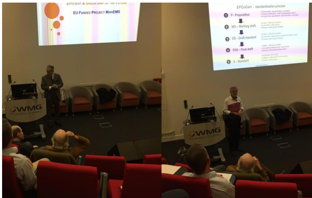
#Mentor4WBL@EU Project workshop at Warwick University