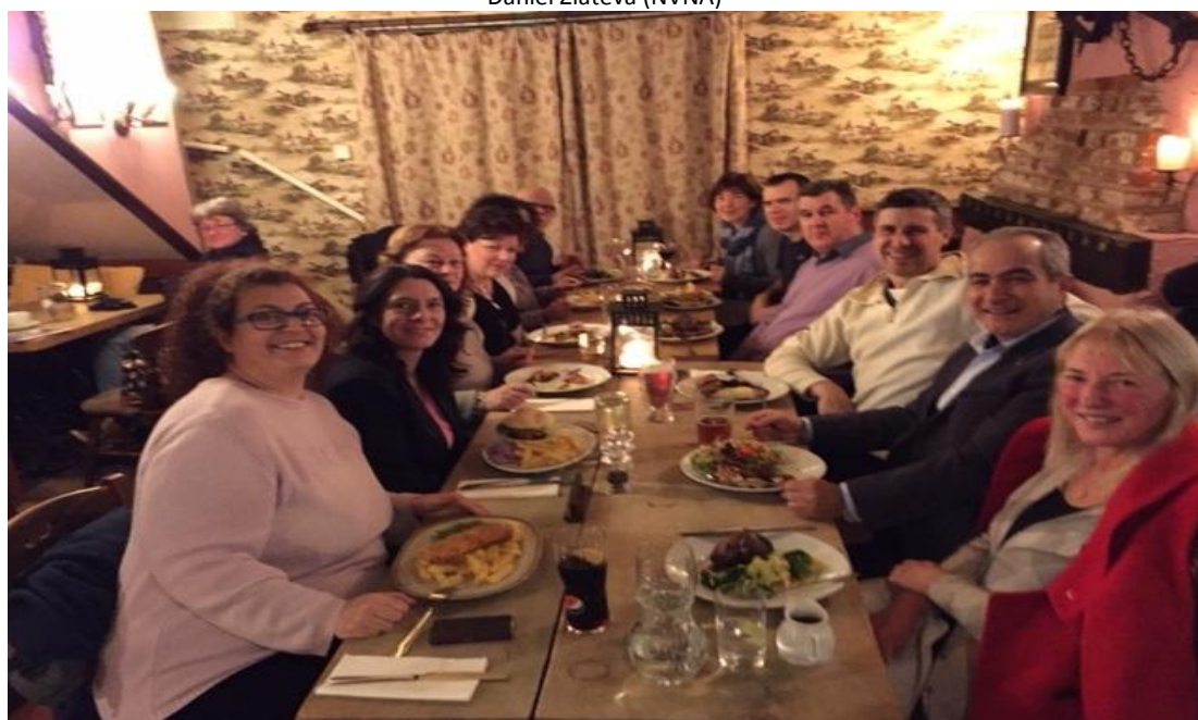
Figure 5. MariLANG Group Dinner