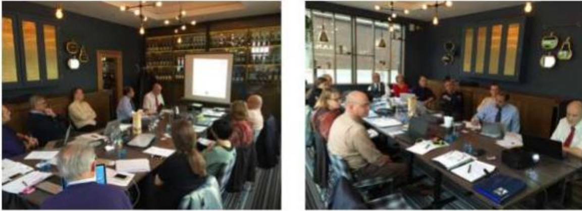
Figure 1. MariEMS Project - 1st Partner meeting

The first partner meeting of the project (MariEMS) which was held on 12th and 13th November 2015 in Kenilworth UK was followed up with a Skype meeting on Wednesday 16 th December 2015. The project can be accessed at www.mariems.com .