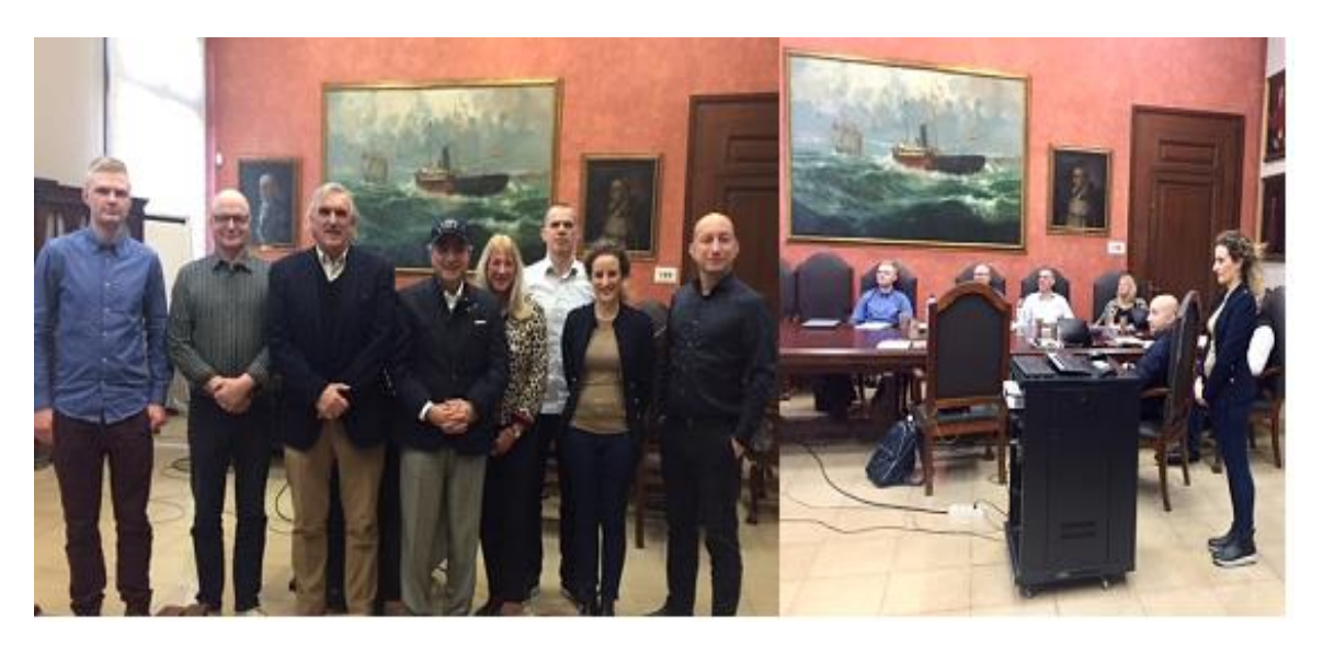
GreenShip Project Team from Spain, UK, Finland, Italy, Greece and Slovenia

This an Erasmus+ project started in October 2019 when the details were published in MariFuture. The kick-off meeting took place in Barcelona on 9-11 December 2019.