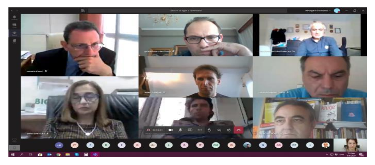
A snapshot of the virtual Mentor Multiplier Event organised by the Project Lead on 18<sup>th</sup> January 2021

Since the virtual multiplier event there have been several virtual partner meetings as well as several meetings with specific partners involved in IO 5. The IO 5 is now concluded and work on IO 6 is continuing.