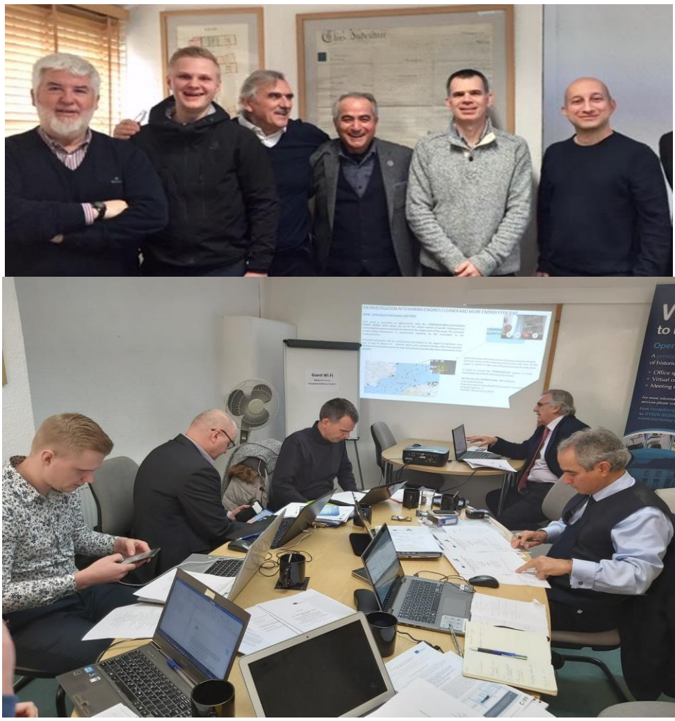
Figure 5 and 6 (above) is of the partner meetings based at C4FF, Berkeley House

The Satakunta University of Applied Sciences (SAMK) has organised an online event on Towards Zero Emissions on Thursday 29 October 2020 at 10.00–13.00. For more information click <u>here</u>